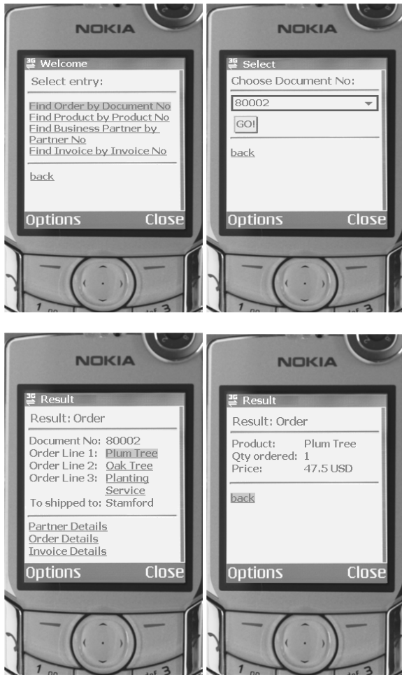
Figure 3. Nokia 6680 Interface Displaying Sales Orders

Unnecessary line breaks and spaces were eliminated, and the content was grouped with regard to its significance to the user. The most important data are displayed on the first screen. Additional details about order lines, shipment and billing conditions can be obtained on subsequent pages. It should be noted that instead of displaying all data as on a Compiere form, only such data relevant in the specific context are displayed.